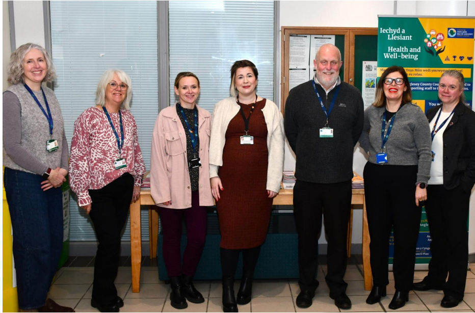
1 - Some of the board members.

The Corporate Safeguarding Operations Board is a cross-departmental group of staff who meet regularly to drive forward the Council's safeguarding agenda. They support policy development, training, and awareness across all services.